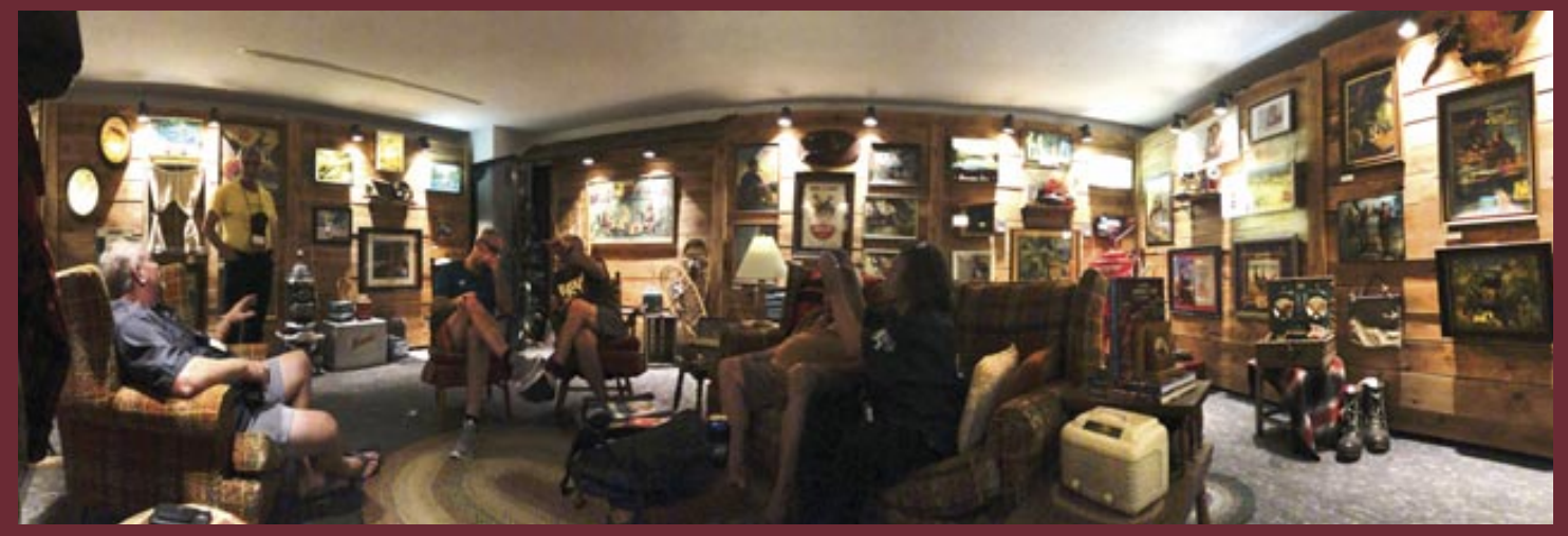
A panoramic shot of a hotel suite stunningly transformed into an experiential breweriana exhibit.